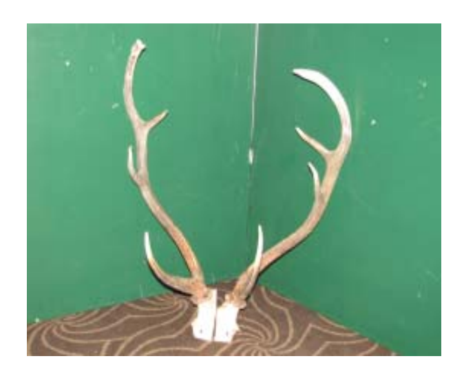
The Deerstalker Page 18