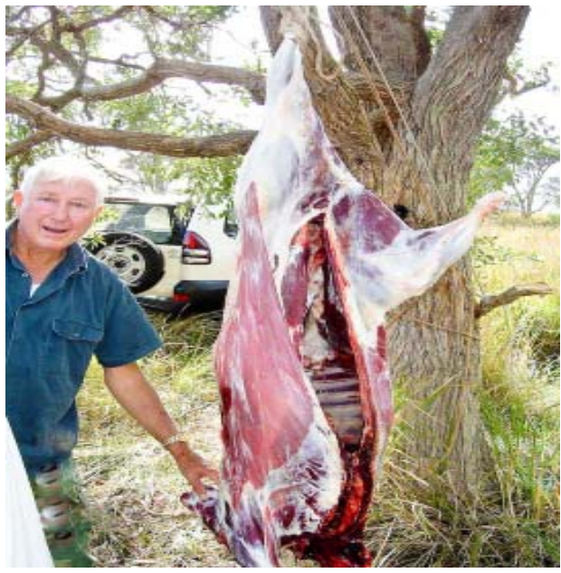
Check to ensure that you have dragged all fat free of the carcass and that any tissue pieces are