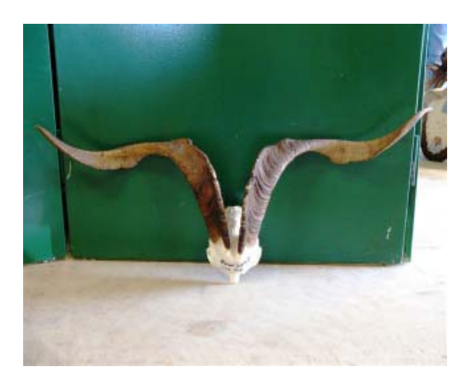
Dick Archer's bow shot goat