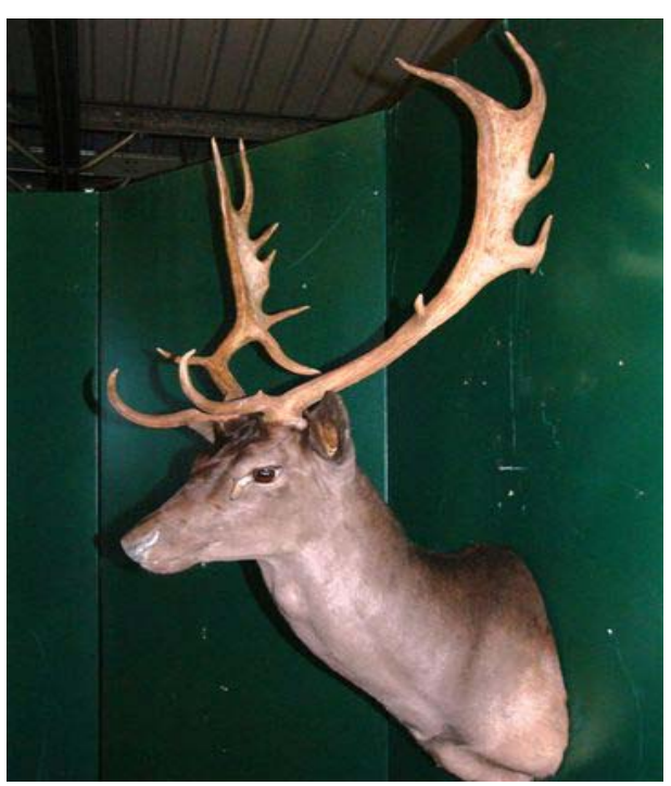
Jason Archer's Fallow buck bow trophy.