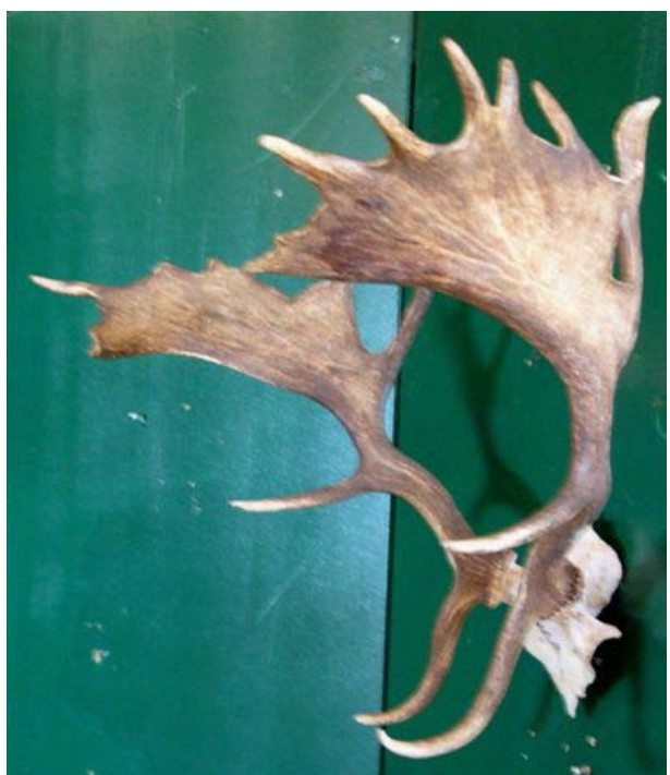
Archer's Fallow bucks, above and below