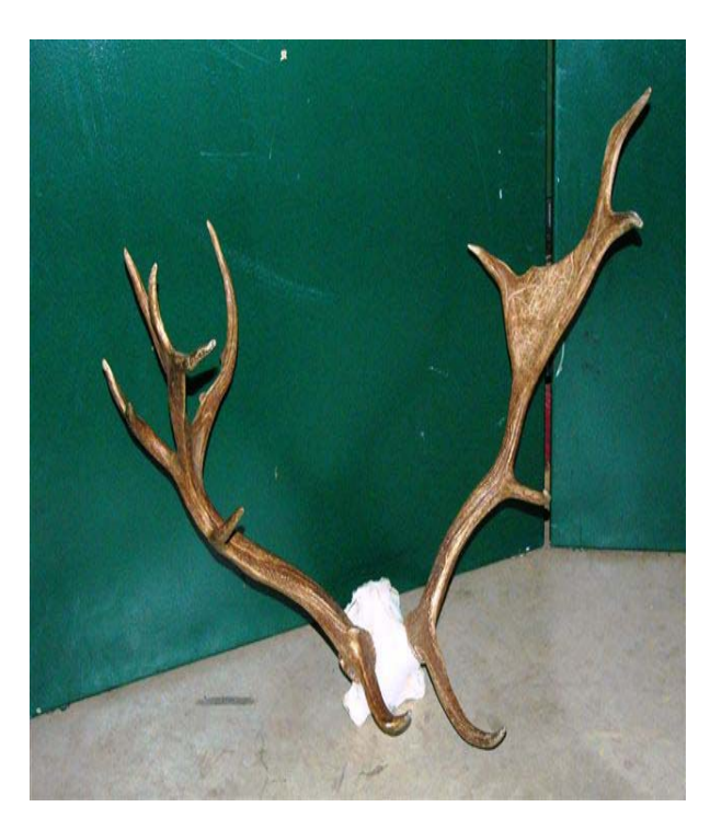
Ross Townsend's Fallow buck.