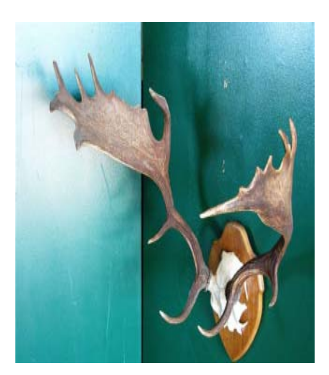
Dal Birrell's Fallow buck.