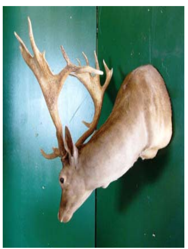
Two more Falow bucks from Chris.