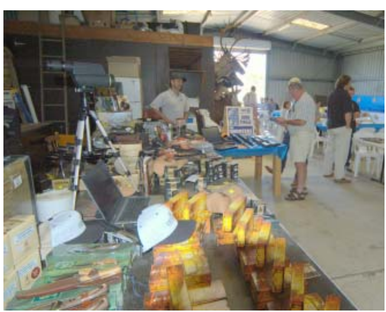
Horsley Park Gun Shop stand offered specials on a wide range of merchandise.

Some spectacular trophies were exhibited with members travelling far and wide across the globe to satisfy their adventurous spirits. Hunting Trophies taken under fair chase conditions can mean a lot of sacrifice in terms of dollars and weeks away. It was obvious by the quality of the Trophies on display that the members are as keen as ever and that some of the younger boys and girls are making inroads into this life long pursuit which Trophy Hunters embrace as a way of life.